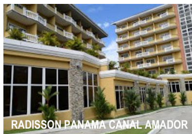
RADISSON PANAMA CANAL AMADOR